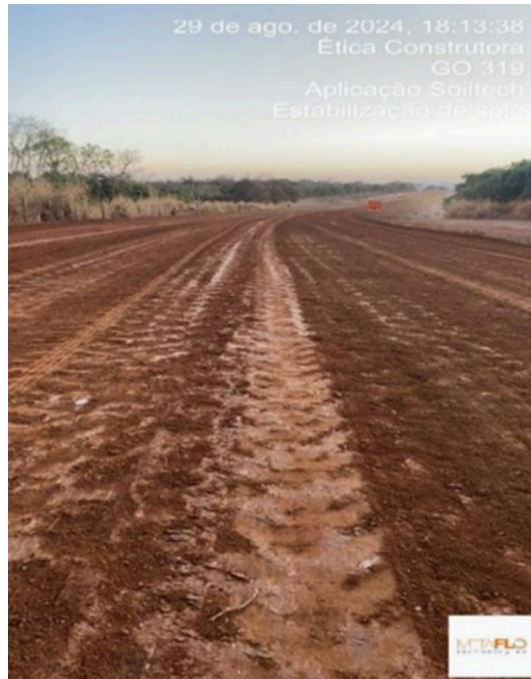
Figure 2: Soil stabilization with SoilTech